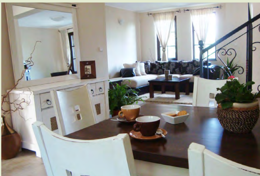
Deluxe style furniture at Geshaview.

Geshaview is proud to present to its guests and owners the first two completely furnished townhouses.