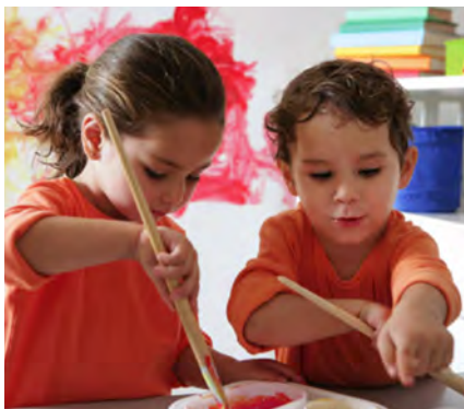
Kindergarten and nursery school for children.

Nursery school, private school for the youngest, courses and open classes throughout the year - the Geshaview team is creating its own unique strategy for a new type of education facility in beautiful surroundings.