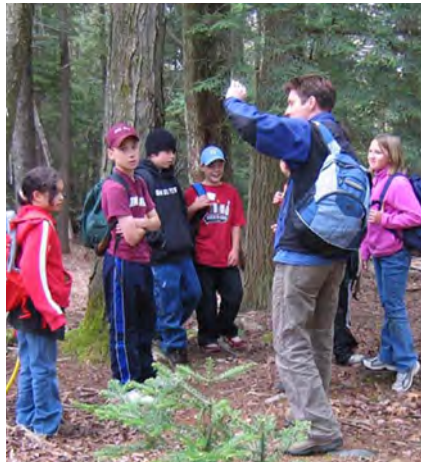
Lessons in survival in the forest.

The modern proactive generation requires the establishment of an entirely new strategy for rest and relaxation. Lying around the pool sipping cocktails is no longer exciting, the new dream vacation is for a completely unusual place to learn and practice new and