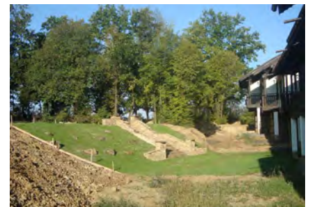
Garden lawn test area.

We can't wait for next Spring when we will start to see the full colour of all the hard work by the landscaping team.