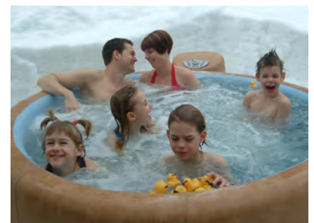
Softubs are great fun for all the family, whatever the weather!

Sized and styled to fit onto almost any size balcony the 3 sizes and 3 colours of Softub make it easy to choose.