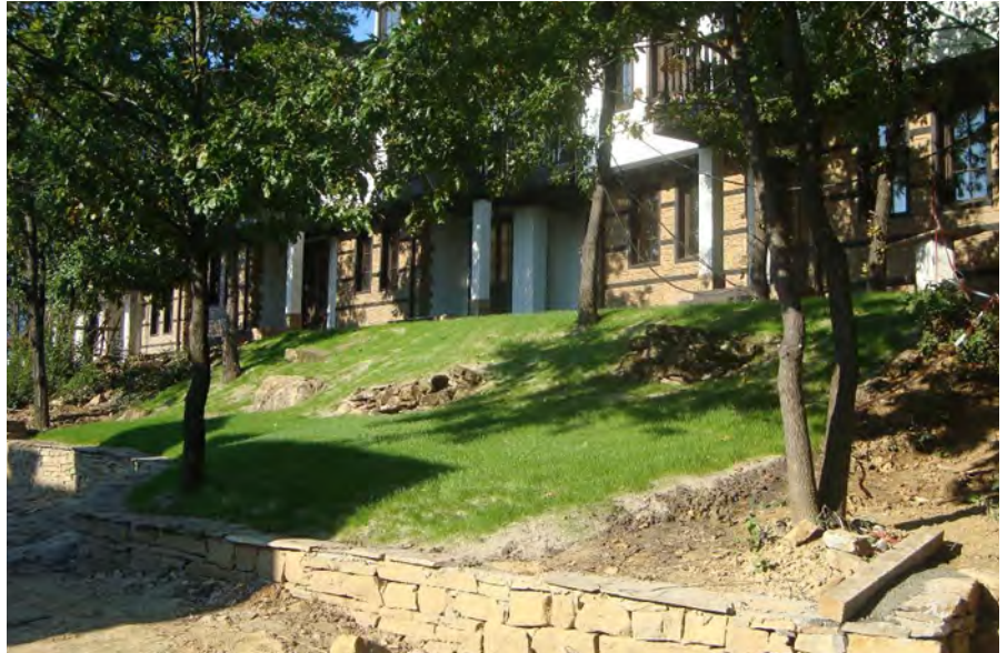
Initial landscaping test areas throughout the village.

September saw the initial tests for the all important landscaping of the village.