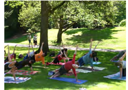
Wellbeing exercises in the fresh mountain air.

Dance classes for all ages, outdoor yoga and aerobics sessions, lessons on surviving in the woods for children who have never been camping. Caving and paragliding for the lovers of extreme adventure... Geshaview is a place where you can find it all.