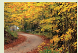
The autumn colours of Bulgaria.

For tours and visits to the village please contact: info@geshaview.eu • UK / EU: +44 (0)1202 201300